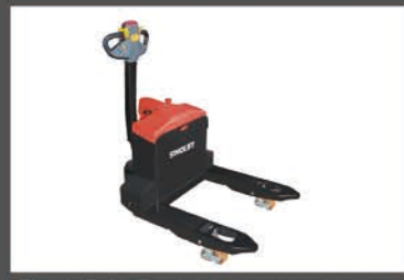
• Electric Pallet Truck (can be customized to lengthen, widen, shrink)

The EPT20 series mini walkie pallet truck has been engineered to be both powerful and flexible to meet the requirements of many demanding applications. Whether it's supermarket work, delivery service, stock replenishment or heavy manufacturing.