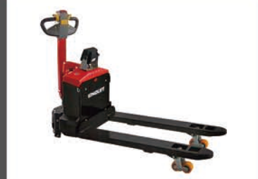
• Electric Pallet Truck (electronic weighing )