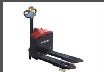
• Electric Pallet Truck (narrow legs can be added to the auxiliary wheel)