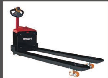
• Electric Pallet Truck (extension fork)