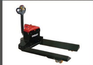
• Electric Pallet Truck (paper roll truck)